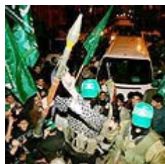
Hamas members celebrate victory in PA elections